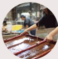
阿波和紙 Awa Washi (Papers)