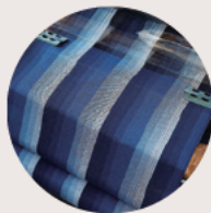
阿波正藍しじら織 Awa Shoai Shijira Ori (Indigo-dyed Cotton Textiles)