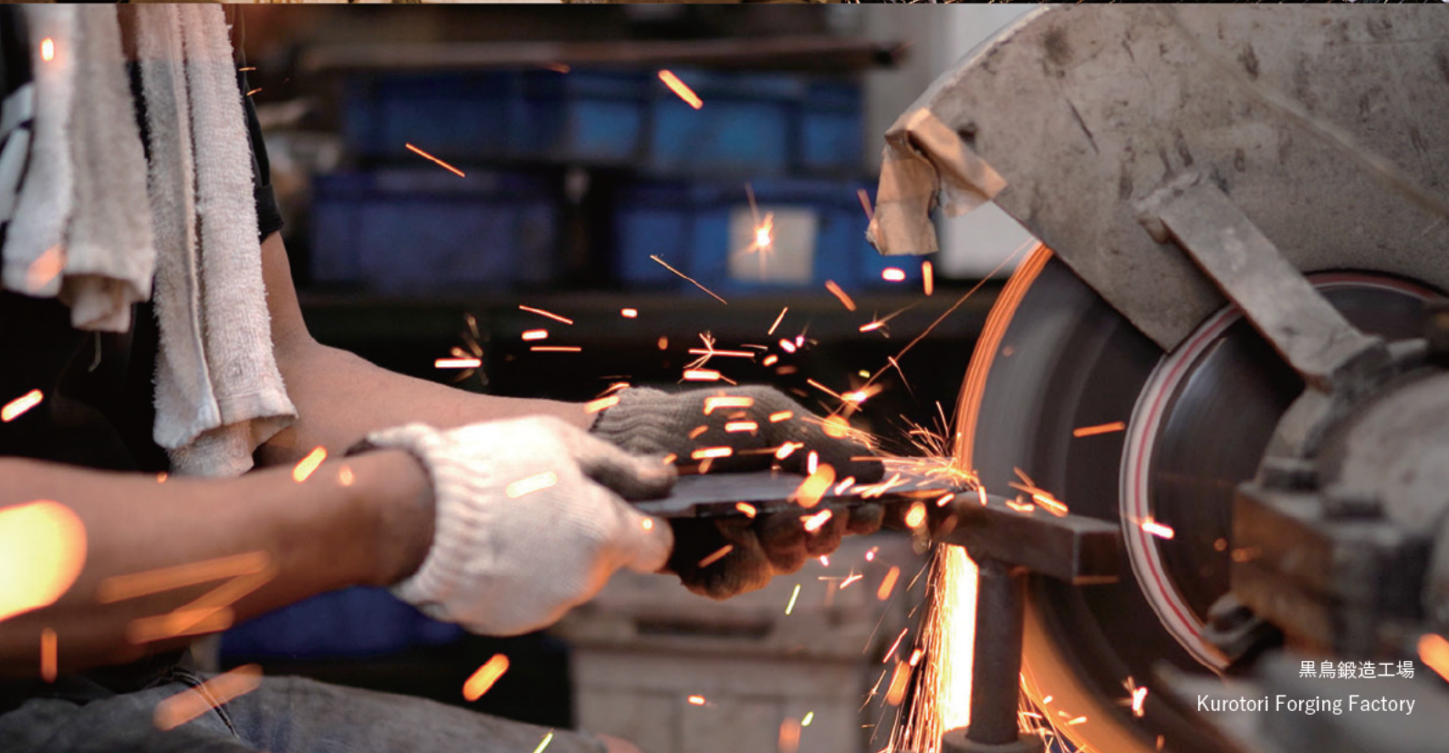
黒鳥鍛造工場 Kurotori Forging Factory