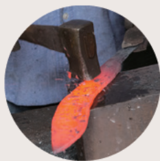
土佐打刃物 Tosa Uchihamono (Forged Blades)

高知県は温暖で多雨な気候と豊かな森林に恵まれ、「仁淀ブルー」と称される清流が、精緻な伝統工芸を生み出す源泉となっています。伝統工芸品には、日本三大和紙の「土佐和紙」や、自由鍛造で作られる「土佐打刃物」があり、自然と清らかな水から生まれた技術が伝承されています。