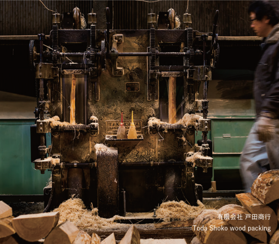
有限会社 戸田商行 Toda Shoko wood packing