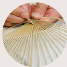
丸亀うちわ Marugame Uchiwa (Fans)

香川県は瀬戸内という豊かな自然や風土に恵まれ、庵治石、手袋、盆栽など、全国有数の産地があります。伝統的工芸品には、「香川漆器」、「丸亀うちわ」があり、『丸亀うちわミュージアム』では、400年以上の歴史を誇る「丸亀うちわ」の製作過程や魅力を紹介しています。