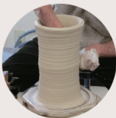
砥部焼 Tobe Yaki (Porcelain)