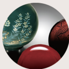
香川漆器 Kagawa Shikki (Lacquerware)