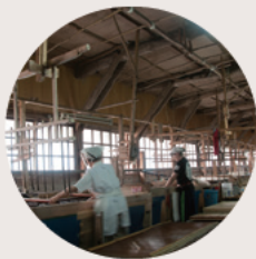
大洲和紙 Ozu Washi (Papers)

愛媛県は温暖な気候と豊かな自然に恵まれ、伝統工芸が発展しました。伝統的工芸品には、精緻な釉薬とシンプルなデザインが特徴の「砥部焼」、手作りならではの繊細なデザインで、美しさと実用性を兼ね備えた「大洲和紙」があり、愛媛の自然と文化を反映しています。