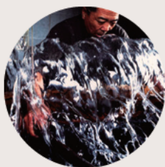
土佐和紙 Tosa Washi (Papers)