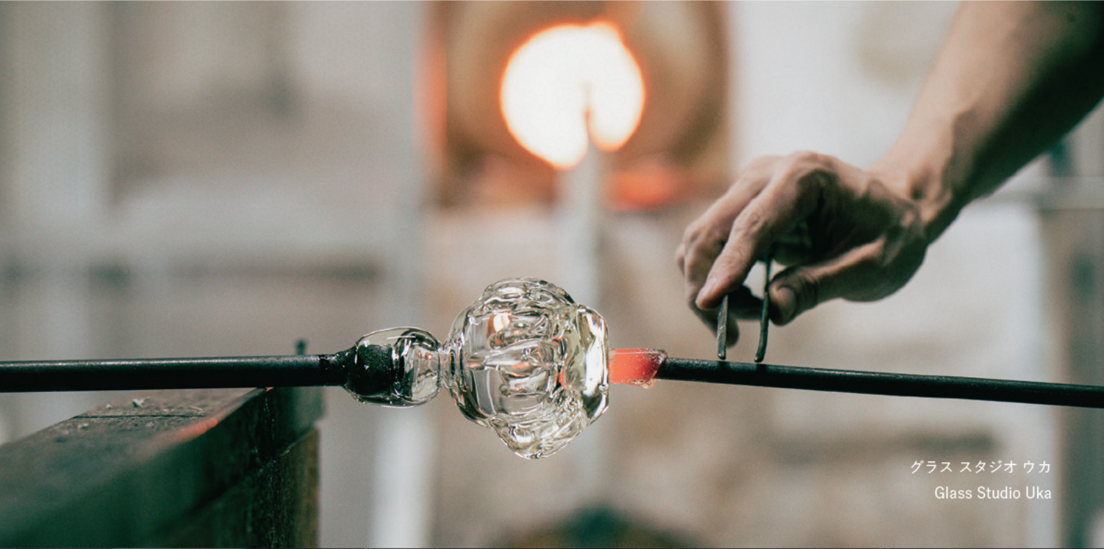
グラス スタジオ ウカ Glass Studio Uka