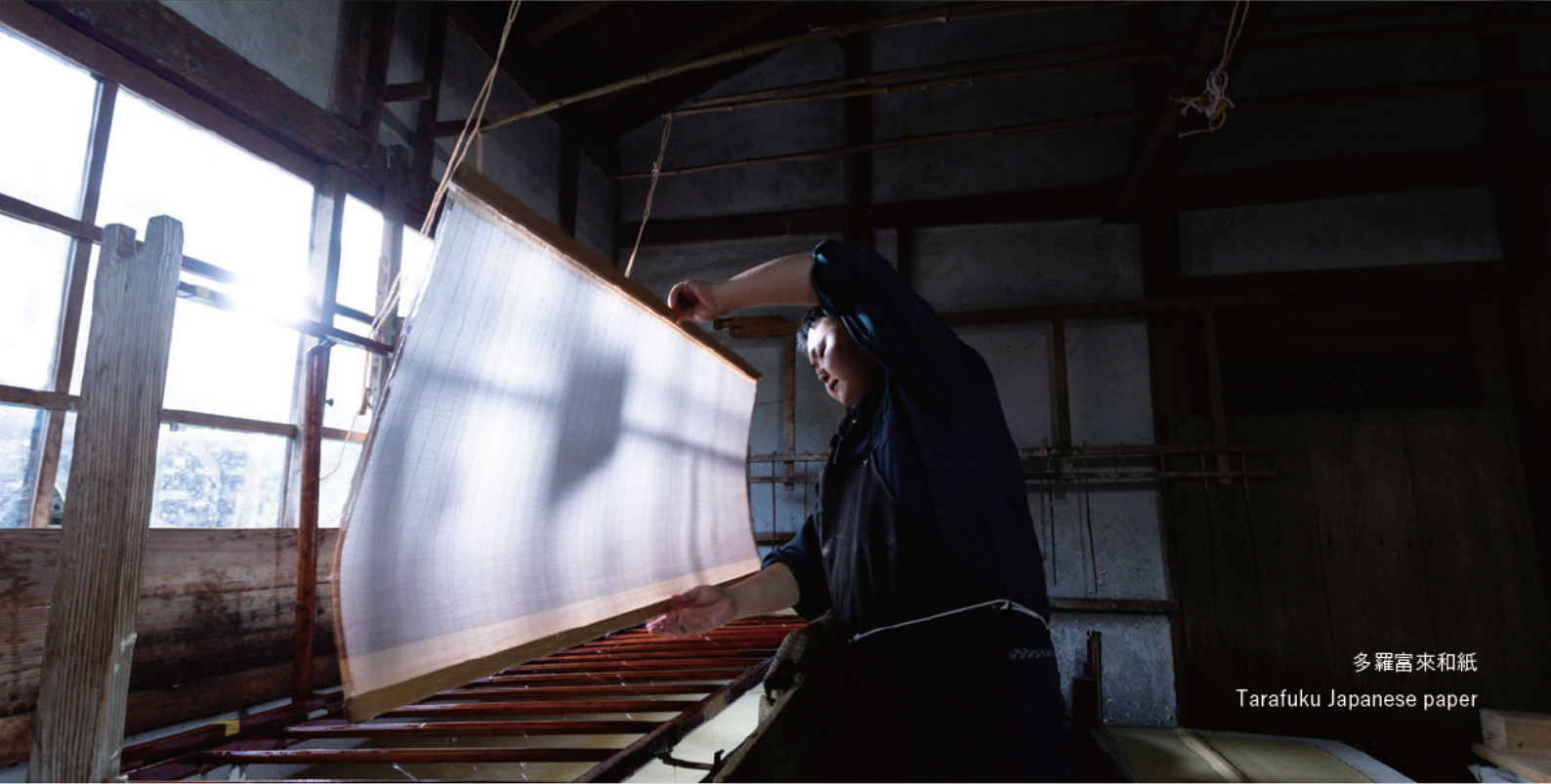
多羅富來和紙 Tarafuku Japanese paper