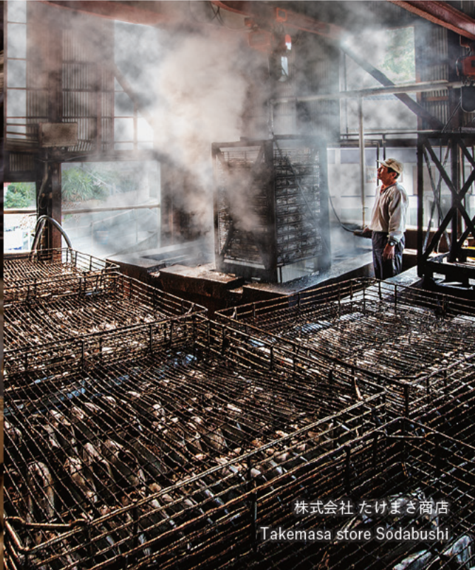
株式会社 たけまさ商店 Takemasa store Sodabushi