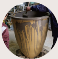
大谷焼 Otani Yaki (Pottery)

徳島県は豊かな自然と伝統文化が息づく地域で、木工業は長い歴史と高い技術を誇り、匠の技が今も息づいています。伝統的工芸品には、「阿波和紙」、「阿波正藍しじら織」、「大谷焼」があり、吉野川の恵みで育まれた藍と、綺麗な水が伝統を支えています。